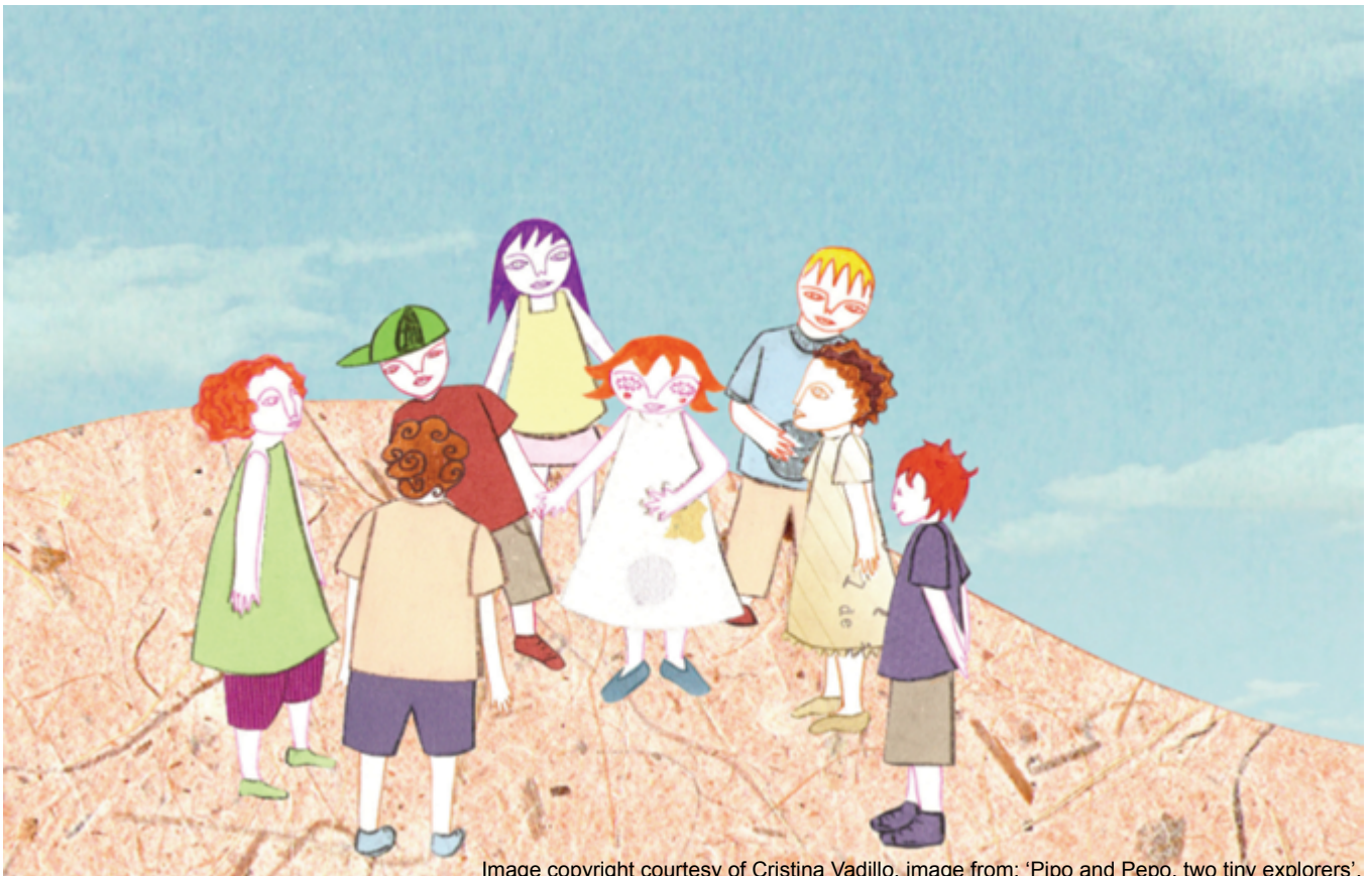
image from: 'Pipo and Pepo, two tiny explorers'.

Endocrine/endocrinology/endocrinologist: related to hormones; a doctor who specialises in hormones and how they affect changes in our bodies.